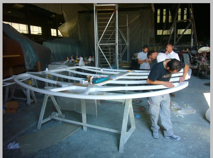
The finishing touches